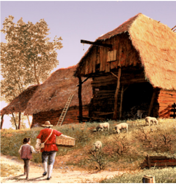
Detail from L.F. Tantillo's painting The Ferry .