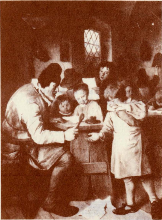
Jan Steen, The Schoolmaster , c. 1663-65 National Gallery of Ireland, Dublin

Parking: A free parking lot is available between the Cathedral and the Cultural Education Center on Madison Avenue.