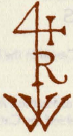
Monogram of the patroonship of Rensselaerswyck

The RENSSELAERSWYCK SEMINAR presents a conference on: