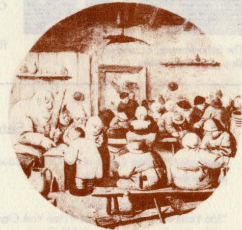
Adriaen Brouwer (follower of), School Interior 1694 Johnson Collection Philadelphia Museum of Art

This conference commemorates the Bicentennial of the New York State Board of Regents