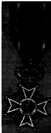
Order of Orange-Nassau Medal