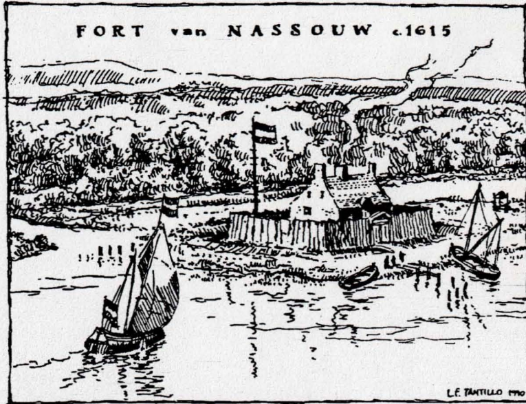
Artist's conception of Fort Nassau on Castle Island. Courtesy of L.F. Tantillo.

New Netherland Project New York State Library CEC 8th Floor Albany, NY 12230