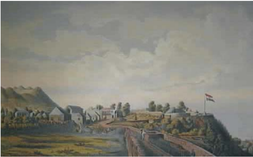
Oranjestad on St. Eustatius by G.W.C. Voorduin, ca. 1860.