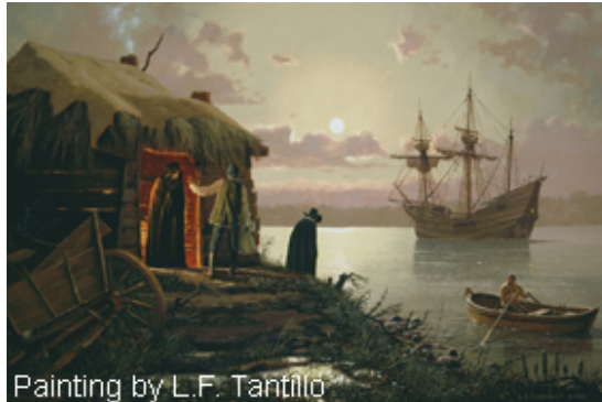
Painting by L.F. Tantillo