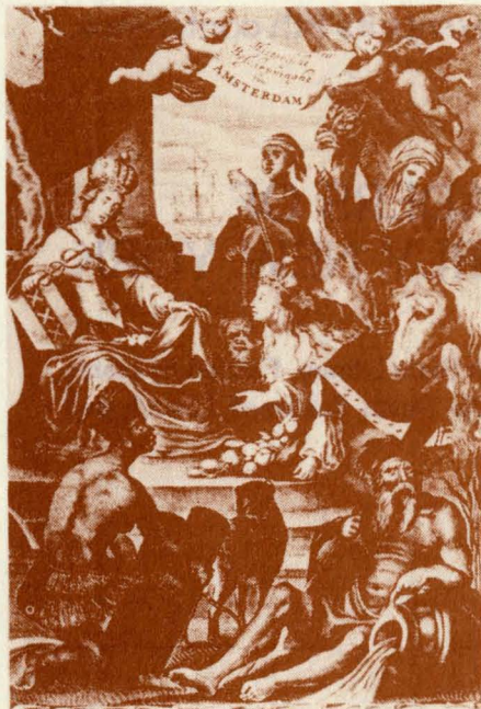
Allegorical representation of Amsterdam's supremacy in world trade in the 17th. century: the four known continents offer their produce to Amsterdam. Title page of Olfert Dapper's "Historische Beschrijving der Stadt Amsterdam..." Amsterdam, 1663.

Location: Student Center, First Floor of the Cultural Education Center in the Empire State Plaza, Albany, New York.