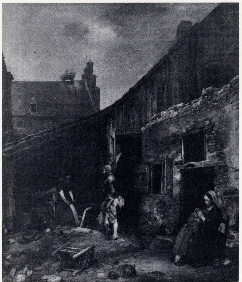
Gerard ter Borch, "The Stone Grinder's Family" Staatliche Museen Preussischer Kulturbesitz Gemäldegalerie Berlin (West)