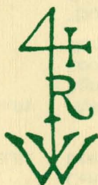
Monogram of the patroonship of Rensselaerswyck