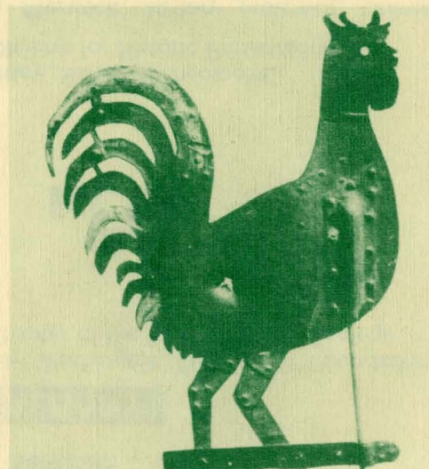
Weather vane

This conference is the New Netherland Project's contribution to the tricentennial celebration of Albany's English charter.